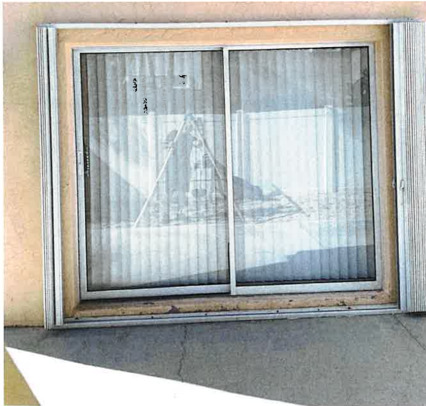
Sample Of New Door